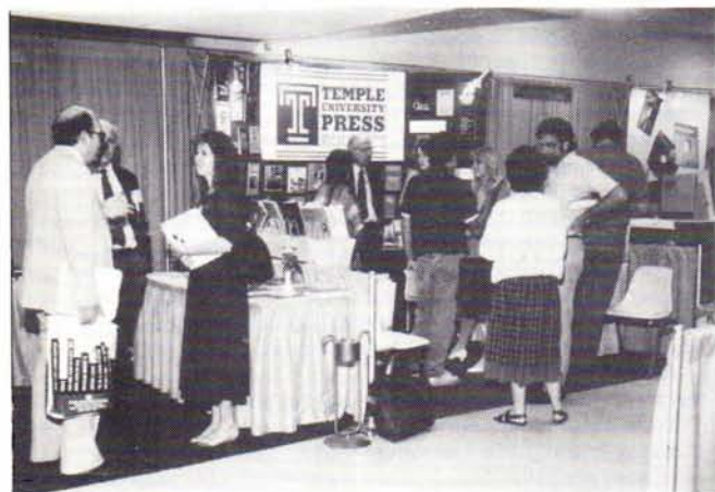
View of one booth in Exhibit Hall