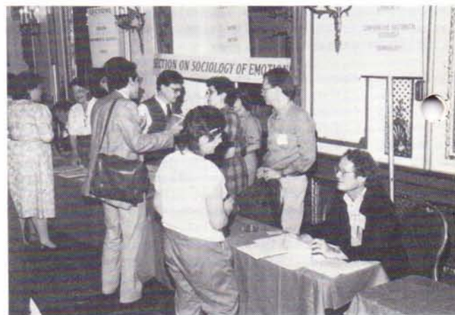
Section information tables at the Welcoming and Orientation Party