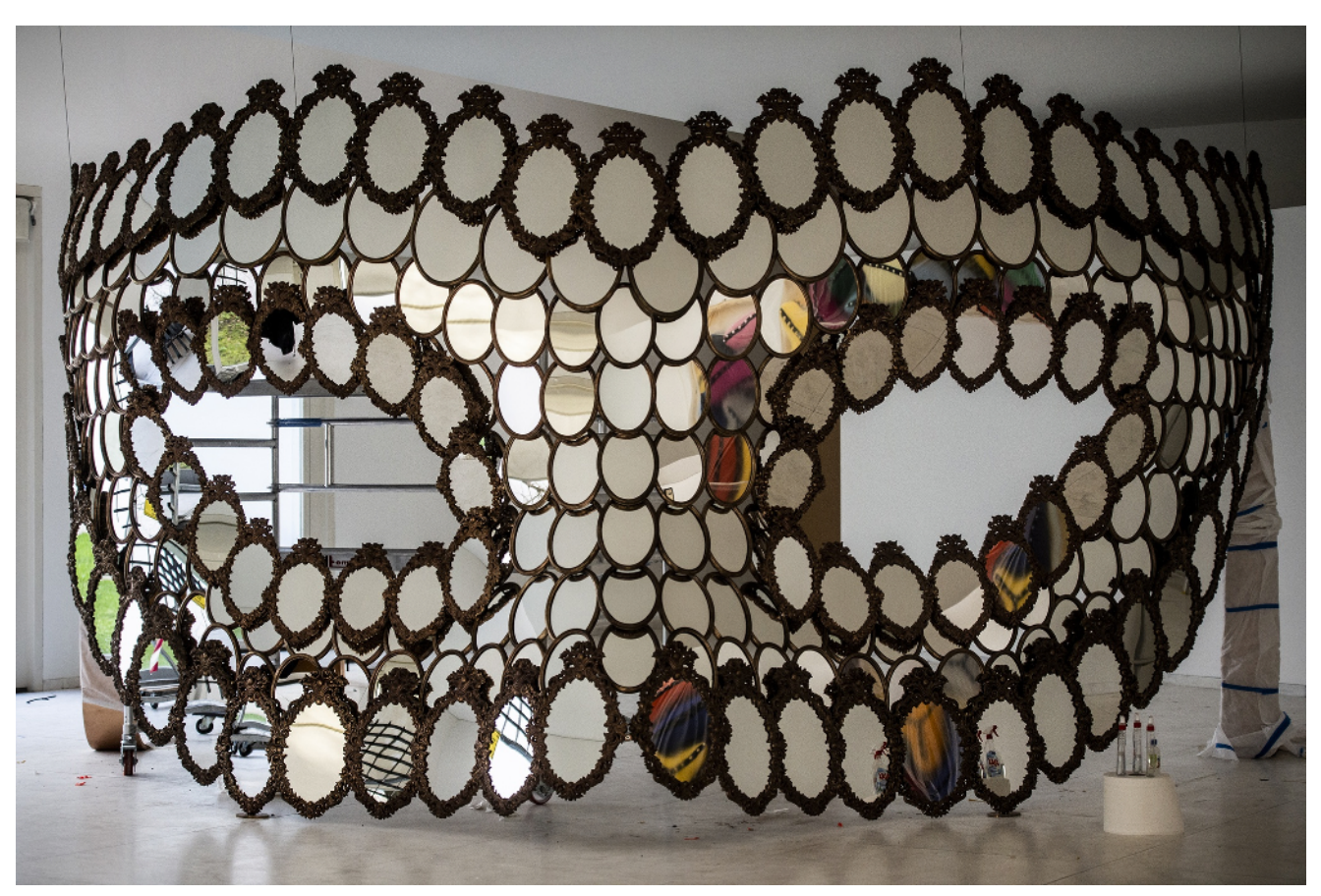
Joana Vasconselos, 'I'll Be Your Mirror' (2018)