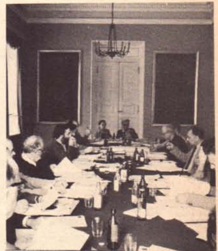
The Executive Committee hard at work