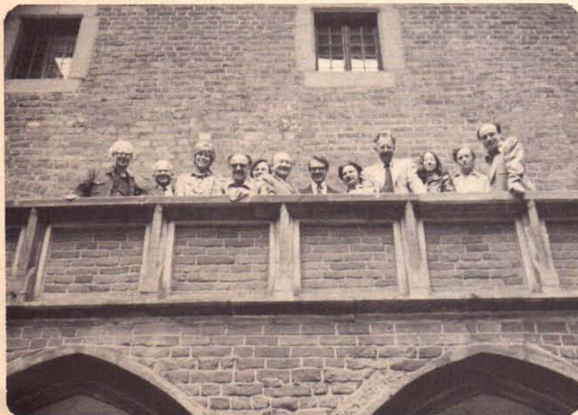
Sightseeing inside Wavel Castle