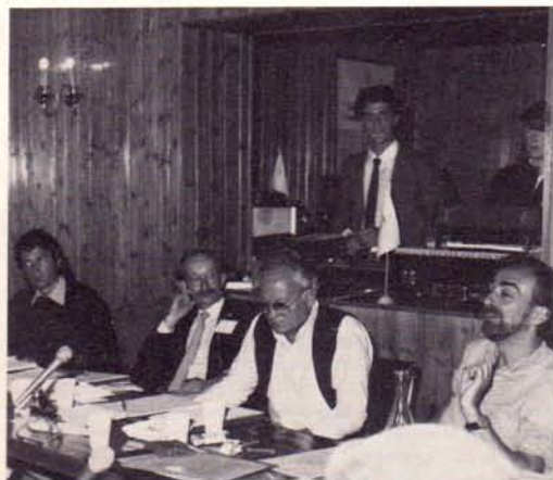
RC 34 SOCIOLOGY OF YOUTH

At the Rome Symposium on "Concept Formation and Measurements" held in Centro Studi per l'Evoluzione Umana