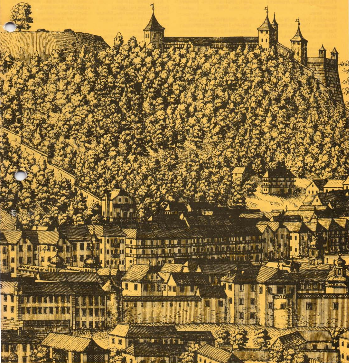
A panoramic view of old Ljubljana