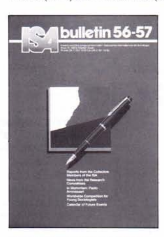
Winter 1991 / Spring 1992

Pinar, 25, 28006 Madrid, Spain Phone (34-1) 261 74 83. Fax (34-1) 261 74 85