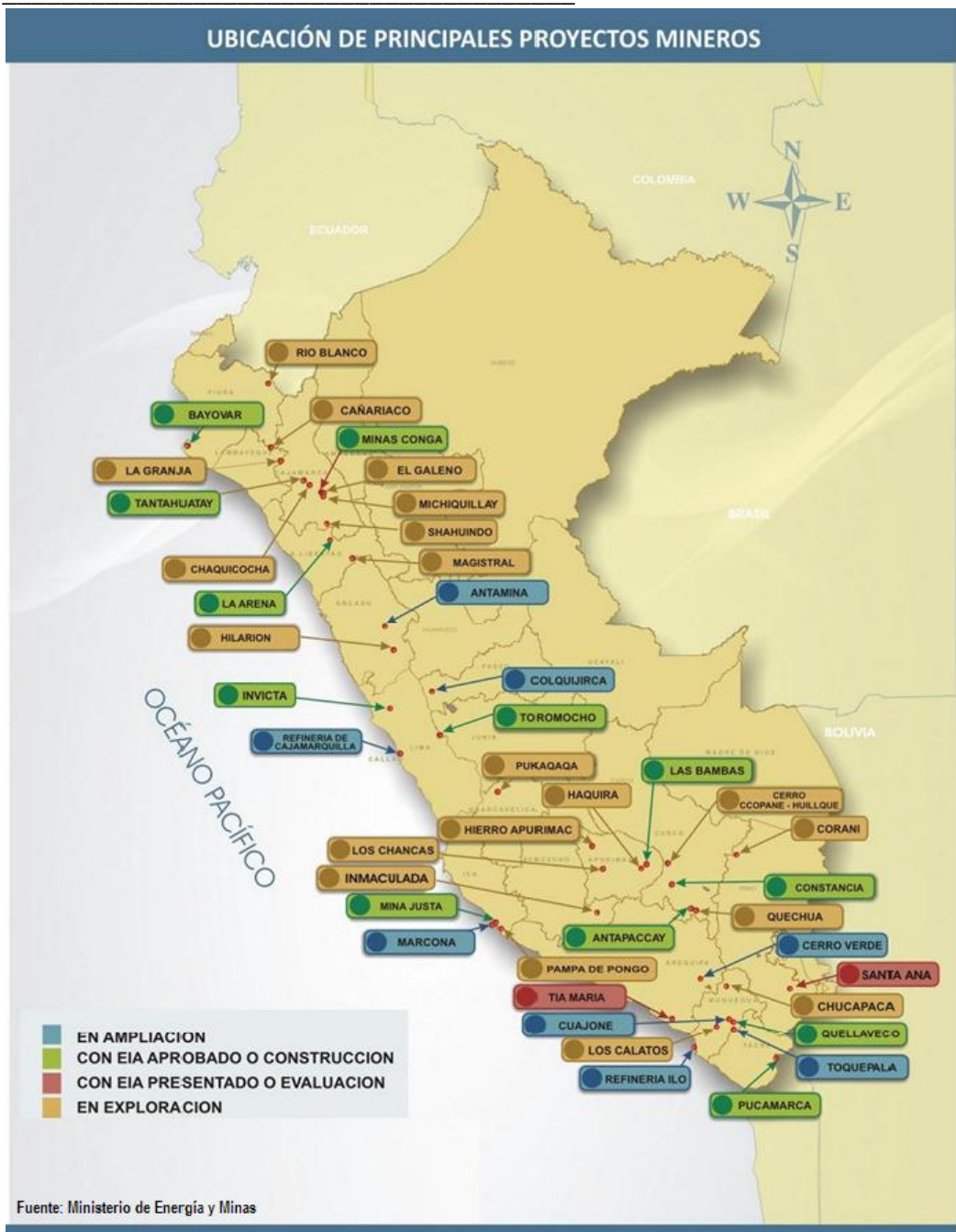
Photo I. Shows the location of the main locations of mining projects.

Mining concessions have grown from 2.26 million - to 2.26 Has between 1991 and 1997 – and up to 26 million has in 2012. 5 At the same time, socio-environmental conflicts have become the most important type of social conflicts in Peru. About 2/3 of public registered conflicts pertain to this category. The two most conflictive regions are Ancash and Apurimac, due to the mighty expansion of mining ventures in these departments. 6