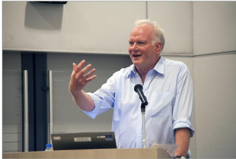
Foto: Ulrich Beck at his Acceptance Speech for the ISARC07 Lifetime Achievement Award on 15 July 2014 at the XVIII ISA World Congress of Sociology in Yokohama, Japan