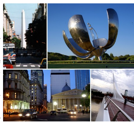
Buenos Aires, Argentina

The Second ISA Forum is fast approaching. RC09 organizes 15 sessions with some 60 papers presented by colleagues coming from all regions of the world. This conference, as the RC09 midterm conference, provides an excellent opportunity for global discussions on social transformations and the sociology of development. Furthermore, the Forum constitutes an occasion to create collaborative and comparative research projects in dialogues between col-