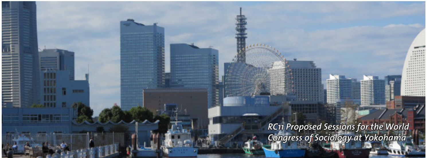
RC11 Proposed Sessions for the World Congress of Sociology at Yokohama