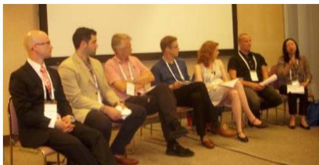
RC-22 Session on Neo-Liberalism and Religious Organizations