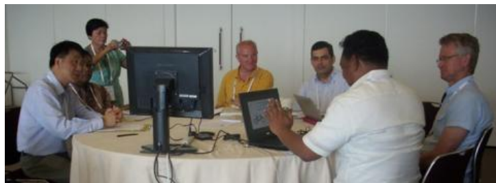
RC-22 Roundtable on Religion and Politics