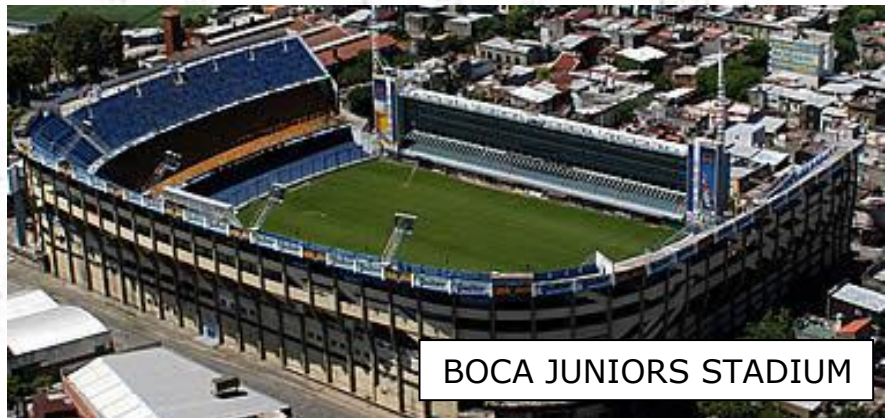
BOCA JUNIORS STADIUM