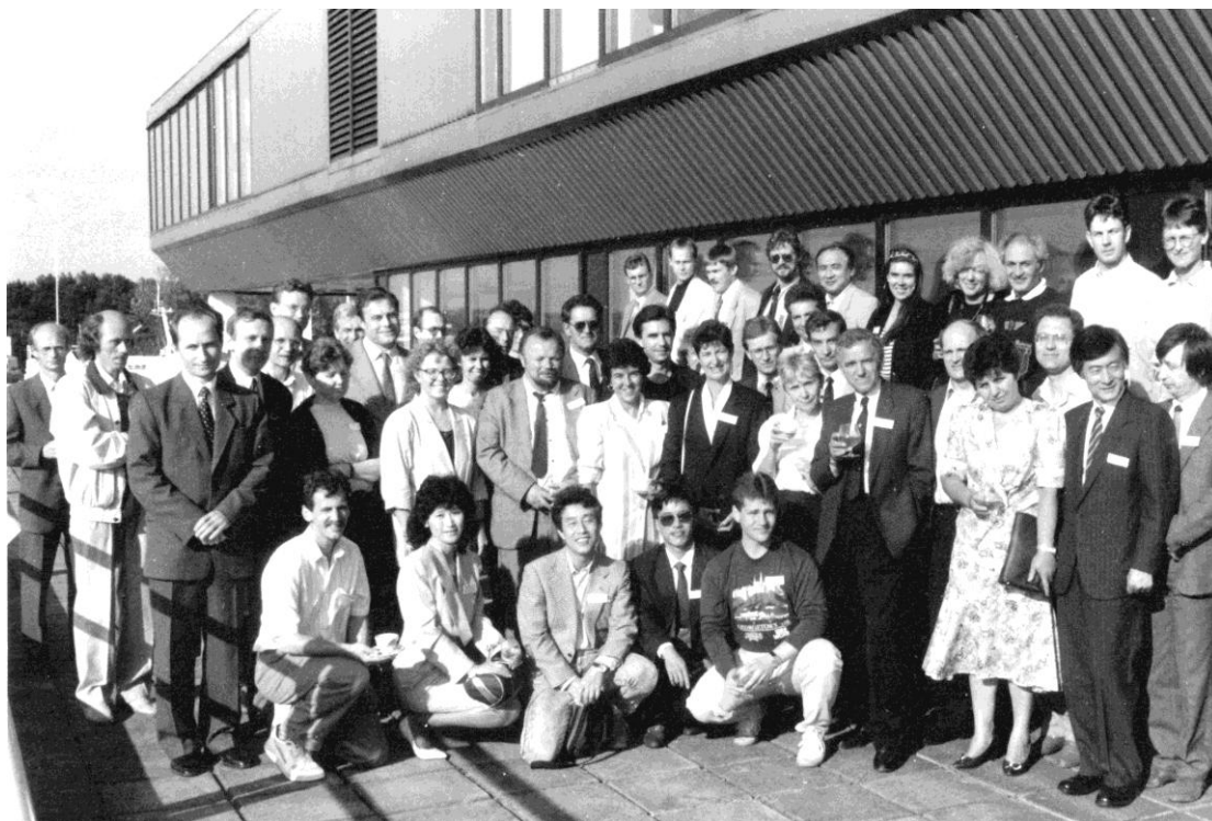
ISSA Tallin 1991

Are you in this photograph? Who else do you recognise? Please tell us!!