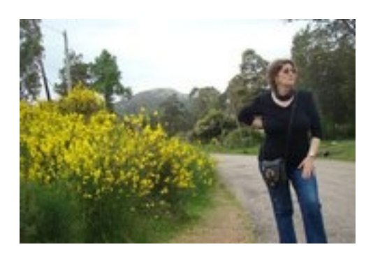
March: gender on the move

In Uruguay, March 2011 has been a month full of activities related to gender topics because, as in previous years, it was appointed as "The Women's Month". Under the slogan "The rights must become facts ", not only have we developed meetings, debates, workshops, roundtables, cultural activities but