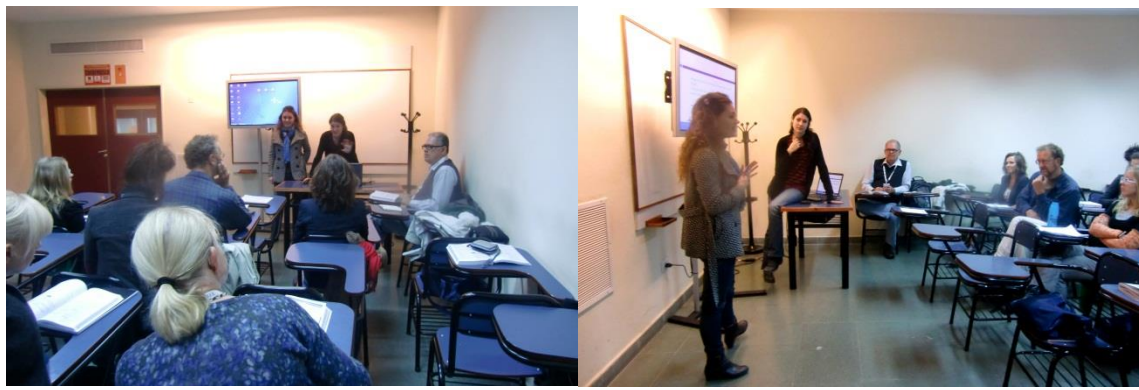
Speakers and audience