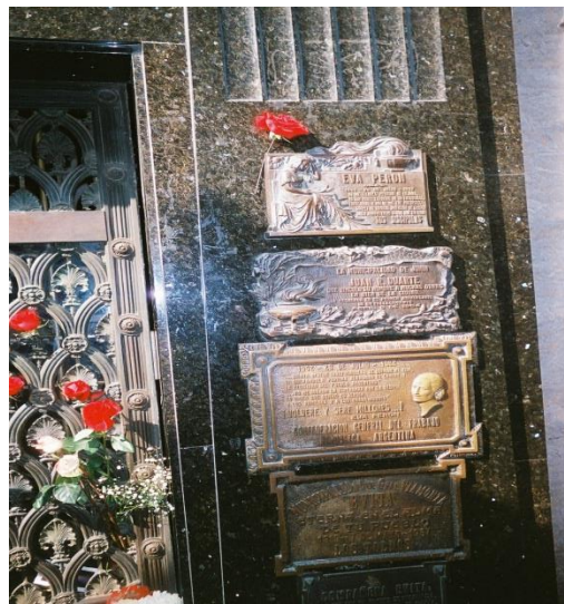
Burial place of Eva Peron, Buenos Aires, Argentina