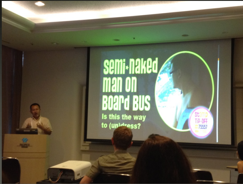
Presenters and participants at the ISA World Congress