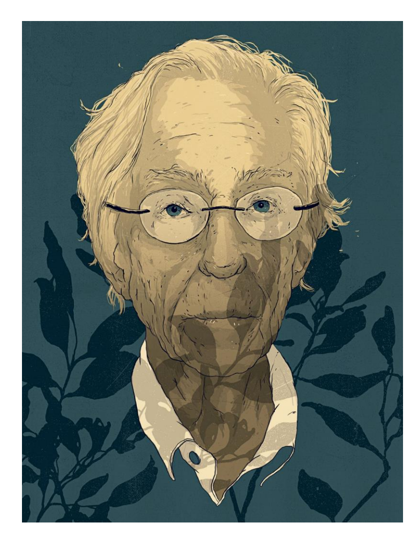
Illustration by Simon Prades, The New York Times, January 5, 2015