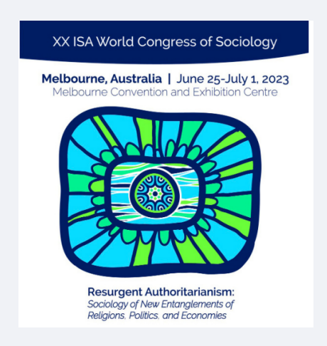
RC26 at Melbourne, XX ISA World Congress of Sociology