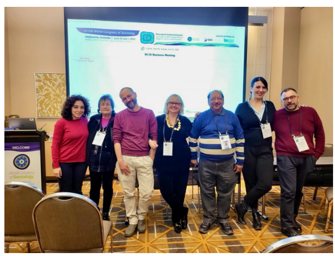
RC26 members at the Congress