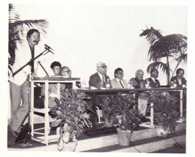
ISA Executive Committee members during the meeting with Portugese sociologists

A group of Portugese sociologists and ISA Executive Committee members in Evora