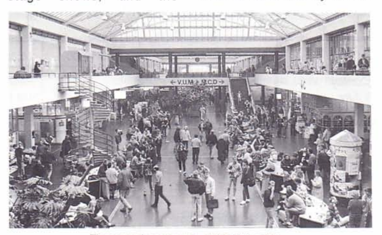
The central concourse of the University.

Bielefeld, easily accessible from all directions by motor-