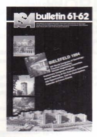
Fall / Winter 1993

Faculty of Political Sciences and Sociology, University of Complutense, 28223 Madrid, Spain Phone (34-1)3527650, Fax (34-1)3524945