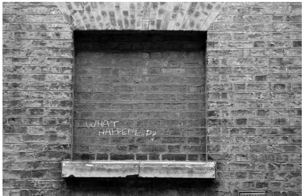
José de Souza Martins