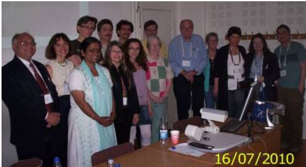
At a RC42 session in Gothenburg