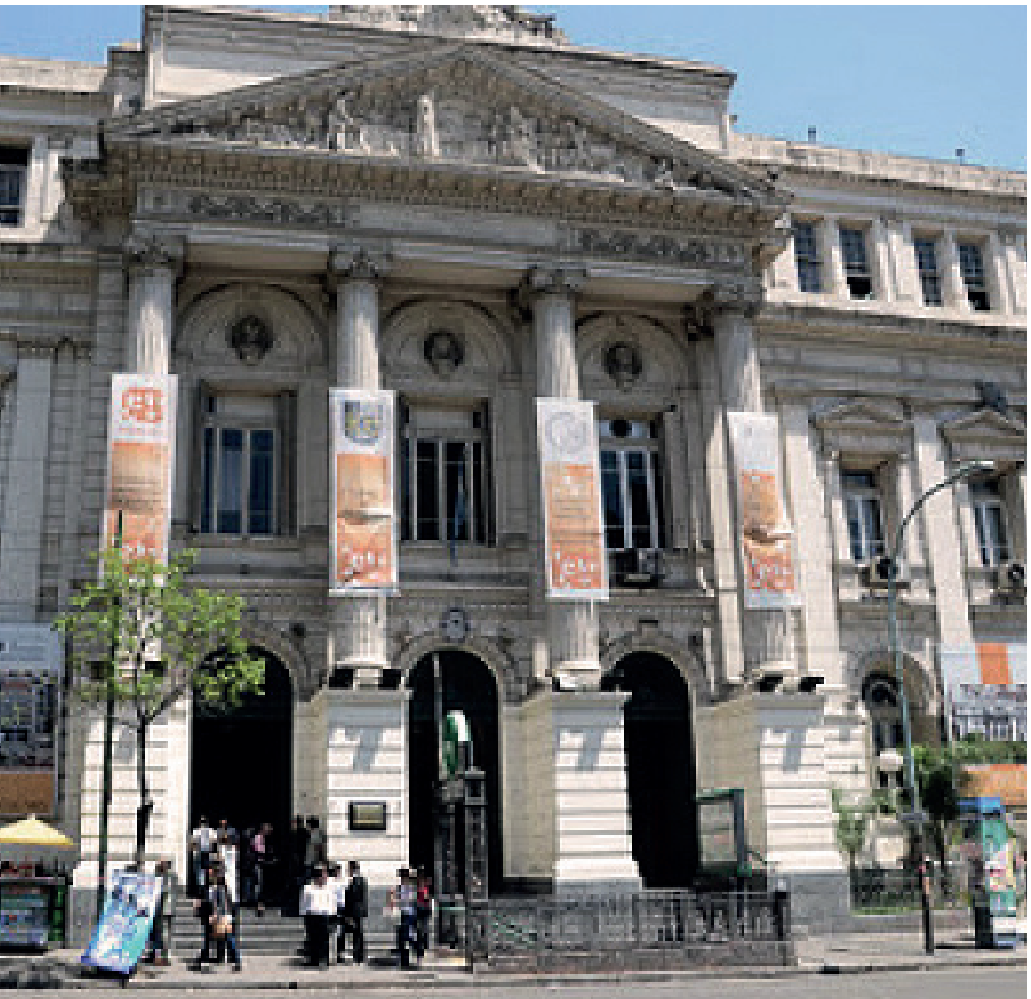
The Universidad de Buenos Aires's School of Economics (Facultad de Economía).

The “ subte ” (subway) has a stop right there, called after the nearby “Facultad de Medicina” (School of Medicine). The exact rooms for our sessions have not been determined yet. Please double-check for more detailed information and any changes upon arrival.