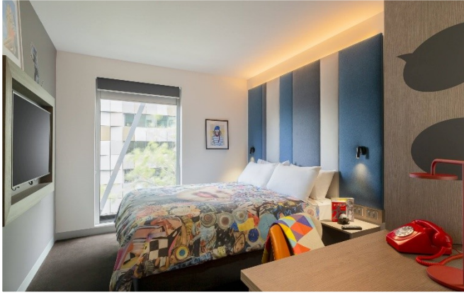
Ink Hotel Southbank