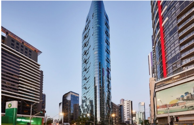
Novotel SouthBank Melbourne