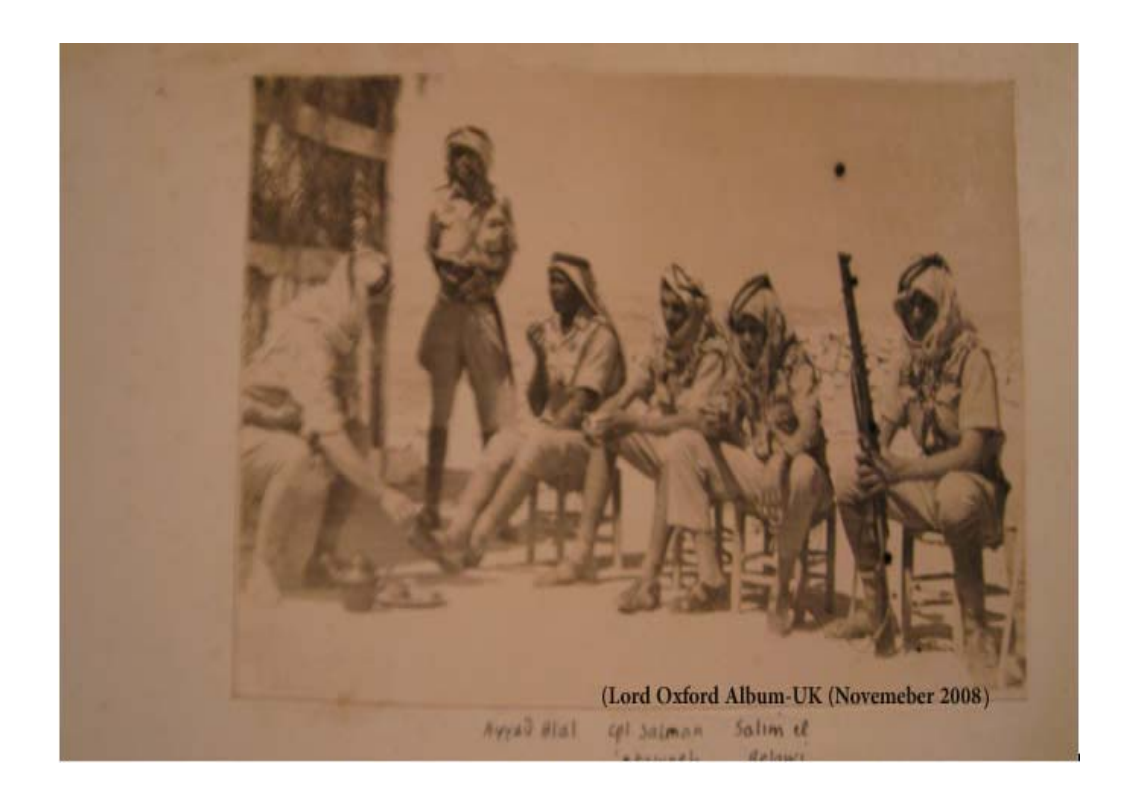
Figure 2: a group of Bedouin Palestine Police "Hajjaneh" in the 1940s

According to Suliman, to support this policy, during the 1930s and 1940s, the British established numerous police stations across the Naqab desert. Bedouin wireless police served in multiple units to connect and link these units. The main military groups were distributed all over the Naqab : Asluj, Auja Al Hafir, Kurnub, Ras Zuweira, Wadi Ghamr, Umm Rashrash, Al Imara, Jammama, Quseima, Khalassa, Ayn Hasb, Ayn Ghadhyan, and Tall Al Malah .